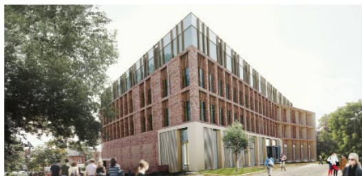
The Esther Simpson building