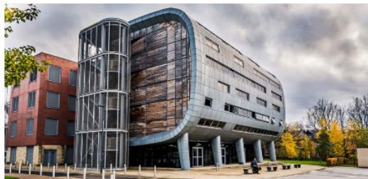
Charles Thackrah building