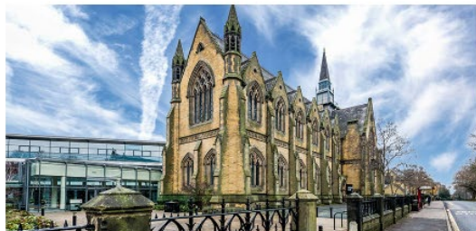
Maurice Keyworth building